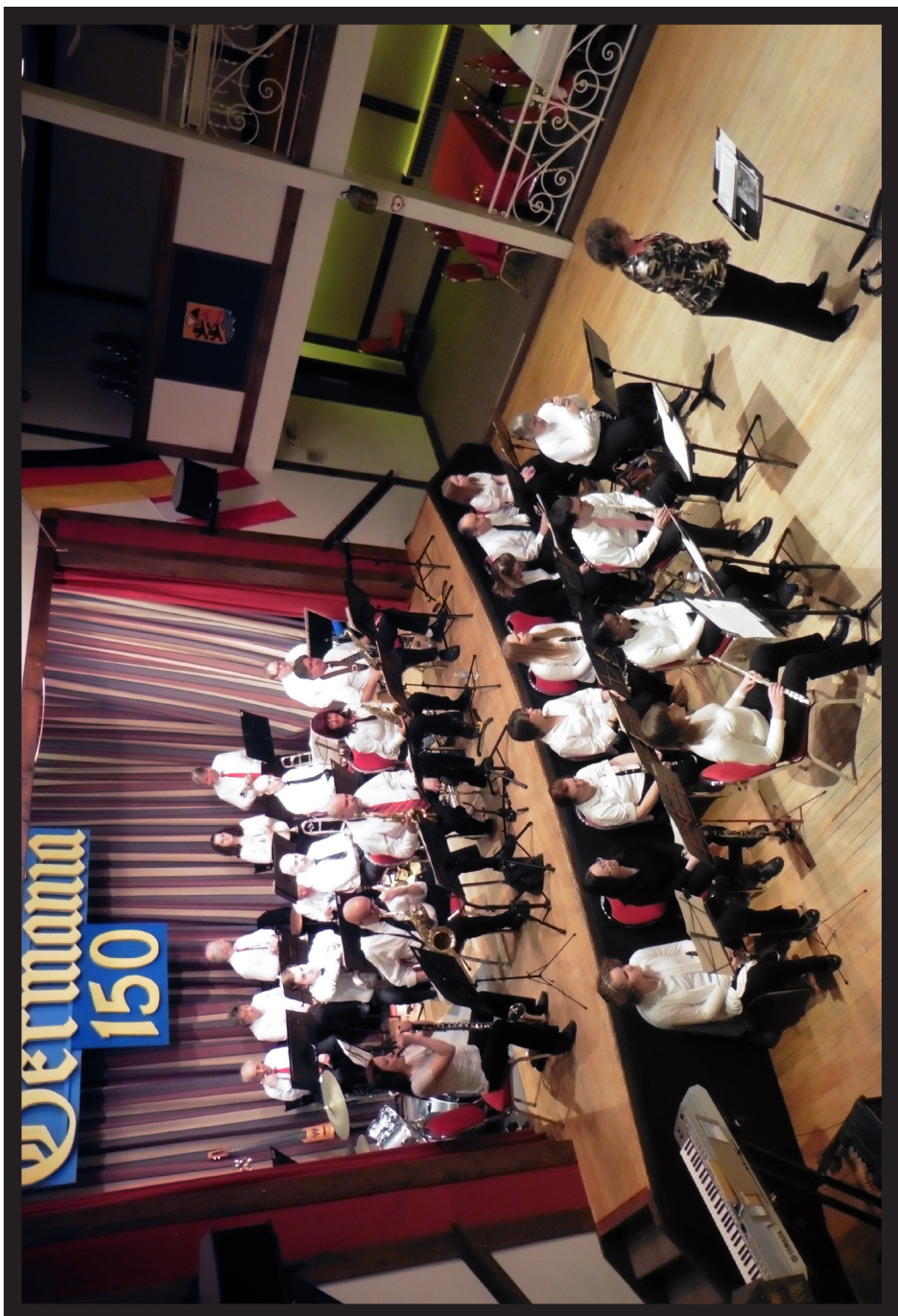
The Hamilton Concert Band performing at the club